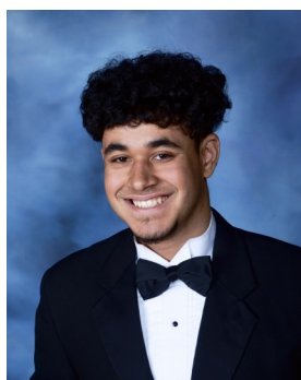
Kean University Computer Science