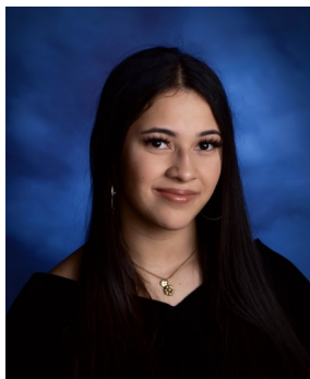
Wesleyan University Chemistry