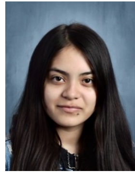
Middlesex County College NJ STARS