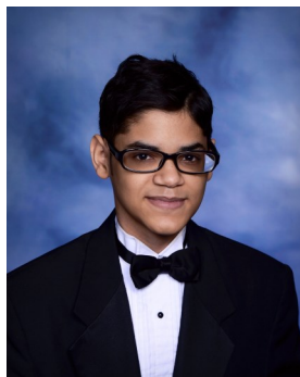
Boston University Physics