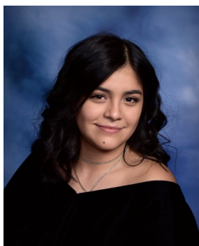
Rutgers University Criminal Justice