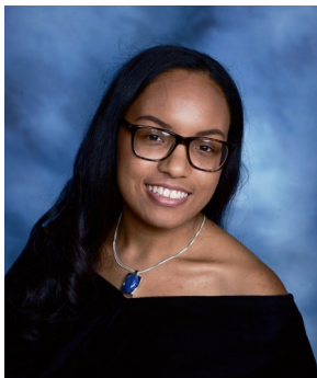
MIT Mechanical Engineering