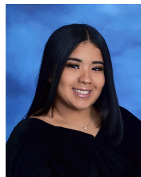
Fashion Institute of Technology Textile/Surface Design