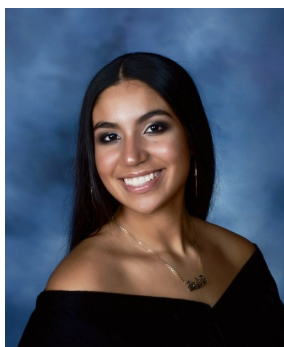
Emory University Business