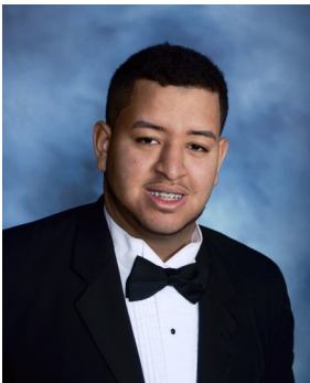
Felician University Biology– Clinical Lab Science