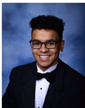
The College of New Jersey Mechanical/Aeronautical Engineering