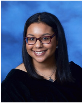
Rutgers University– New Brunswick Marketing