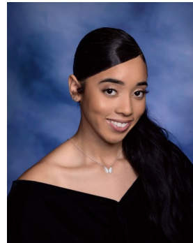
North Carolina A & T Animal Science